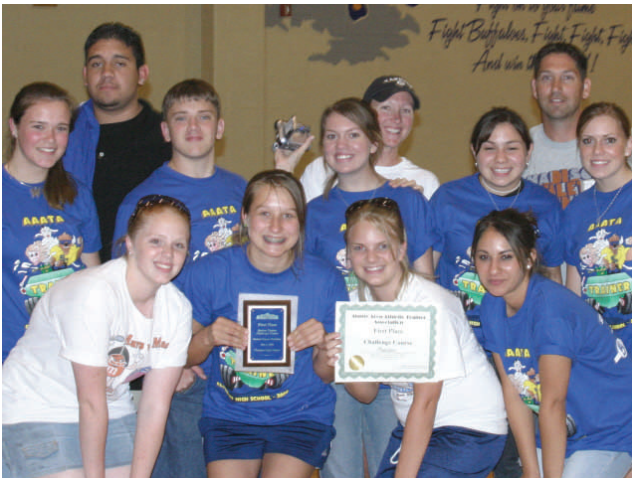
Challenge Course Champions - Madison High School